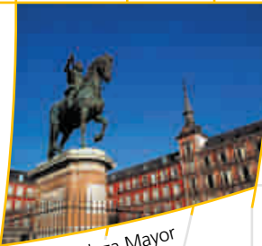
Madrid, Plaza Mayor