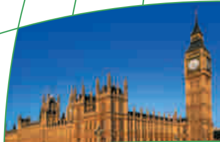
London, Big Ben