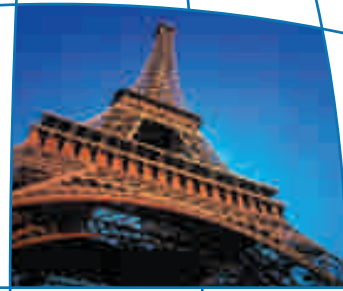
Paris, La Tour Eiffel

soirée d'introduction (en français) on October 4 in-depth workshop on October 6