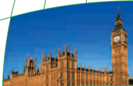
London, Big Ben